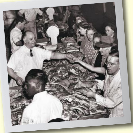
Butcher shop Pierce & Shurr, 1946

Extra virgin olive oils and vinegars on tap